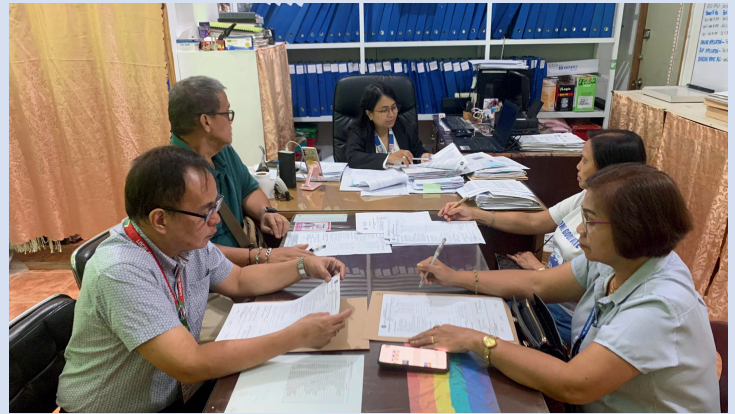
NAMFREL Camarines Norte observing the ERB Hearing at the COMELEC Office in Daet, Camarines Norte

NAMFREL is actively engaging with COMELEC as it prepares for the upcoming elections. NAMFREL Chapters are observing the voter registration process for the 2025 National and Local Elections. Specifically, NAMFREL Maguindanao monitored the satellite registration and Special Register Anywhere Program at Camp Darapanan, Sultan Kudarat, Maguindanao del Norte from April 15-16, 2024.