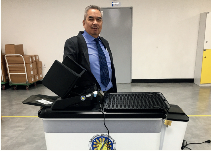
NAMFREL National Chairperson Lito Averia with the new automated counting machine for the 2025 National, Local, and BARMM Parliamentary Elections