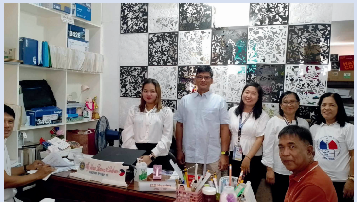
NAMFREL Catanduanes observing the ERB Hearing at the COMELEC Office in Virac, Catanduanes

Various NAMFREL Chapters in different provinces also observed and participated in the election registration board hearings for voter registration applications submitted from January to March 2024. These hearings are important for validating and approving voter registration applications for the 2025 National and Local Elections. Voter registration will be open until September 30, 2024.