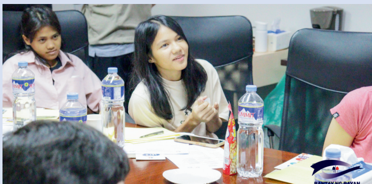
A training participant from Pasig asks a question about election observation

Engaging young individuals in election observation not only promotes transparency and integrity in elections but also fosters a sense of civic duty and responsibility. NAMFREL believes that democracy thrives when people from all backgrounds get involved and take collective action. Young people, in particular, can offer fresh perspectives on issues and bring innovative ideas to the table. They possess untapped potential to drive social change. Involving young individuals fosters a sense of civic duty and responsibility. This early engagement helps them to become well-informed and active citizens as well as future leaders in their communities and the nation. It is precisely this potential that NAMFREL wishes to cultivate within the youth of our country. NAMFREL hopes this training will kick-start their involvement in ensuring free, fair, and transparent elections in the country.