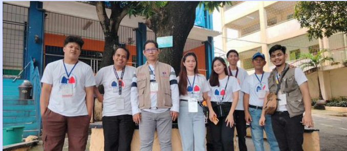
NAMFREL Volunteers on plebiscite day

On August 31, 2024, the NAMFREL Volunteers observed the conduct of a plebiscite in Brgy. Bagong Silang, Caloocan City – the country's most populous barangay. In this plebiscite, registered voters of Brgy. Bagong Silang decided if they agreed to divide the barangay into six (6) independent barangays pursuant to Republic Act No. 11993. NAMFREL Volunteers observed 10 voting centers on the plebiscite day, covering the opening process until the canvassing of results. 25,345 voters actually voted from a total number of 86,153 voters. 22,854 constituents voted in favor of the ratification to divide Barangay Bagong Silang into six (6) separate and independent barangays.