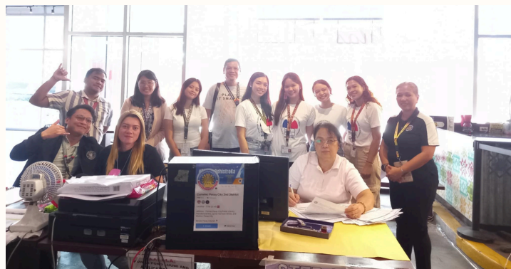
NAMFREL Volunteers observing the conduct of voter registration at the RAP Site in Double Dragon Plaza