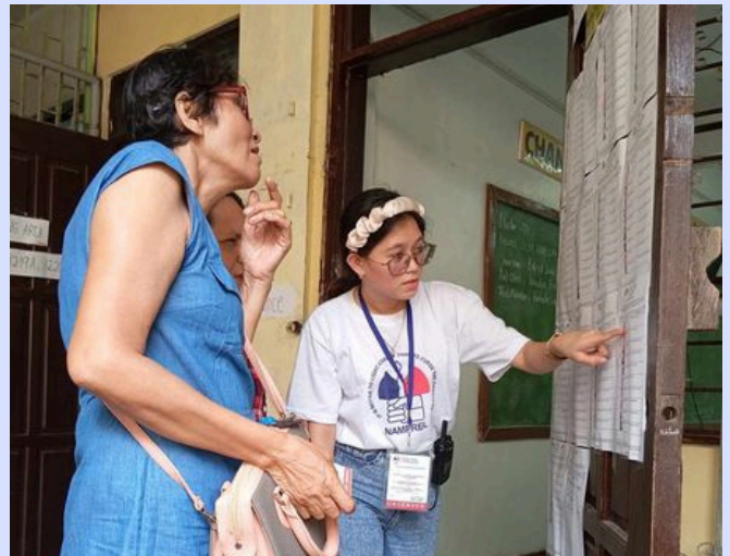
A NAMFREL Volunteer assisting a voter on plebiscite day