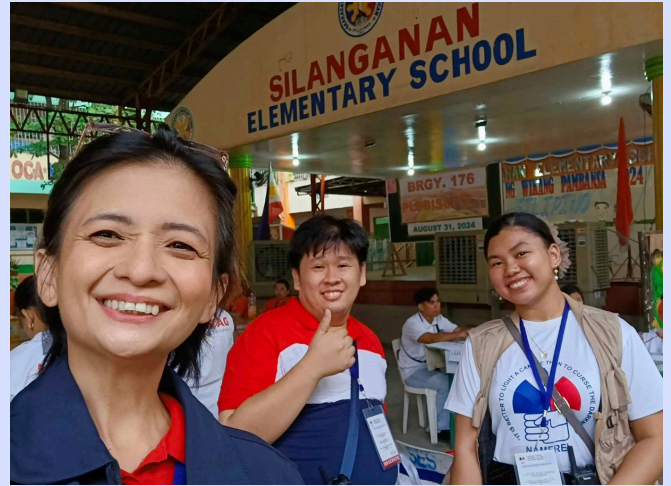
NAMFREL Volunteers monitored the situation in different voting centers on plebiscite day

On August 31, 2024, the NAMFREL Volunteers observed the conduct of a plebiscite in Brgy. Bagong Silang, Caloocan City – the country's most populous barangay. In this plebiscite, registered voters of Brgy. Bagong Silang decided if they agreed to divide the barangay into six (6) independent barangays pursuant to Republic Act No. 11993. NAMFREL Volunteers observed 10 voting centers on the plebiscite day, covering the opening process until the canvassing of results. 25,345 voters actually voted from a total number of 86,153 voters. 22,854 constituents voted in favor of the ratification to divide Barangay Bagong Silang into six (6) separate and independent barangays.