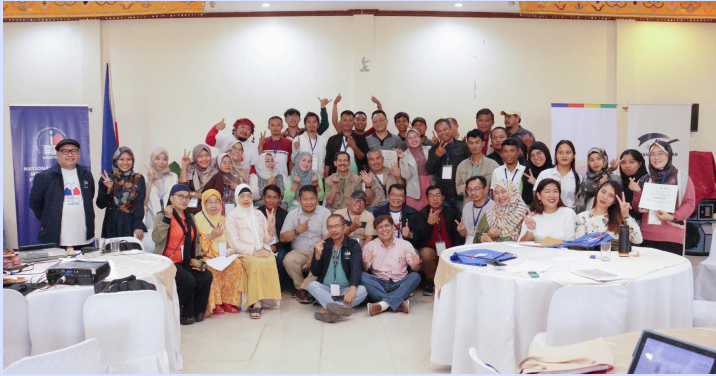
Participants of the 1st Leg of the MBnB Training of Trainers Program with the NAMFREL HQ Team

The NAMFREL MBnB BARMM has been comprehensively redesigned to address BARMM-specific issues and tailored to be culturally and contextually appropriate for BARMM communities. This localized approach ensures that the training resonates deeply with participants, enhancing its impact. NAMFREL aims for the Training of Trainers model to enable participants to share the knowledge and skills gained with their communities, empowering trainers to replicate the program at the grassroots level and expand its reach and influence.