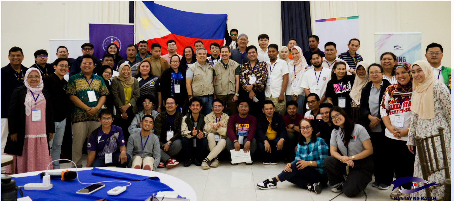
Participants of the 2nd Leg of the MBnB Training of Trainers Program with the NAMFREL HQ Team