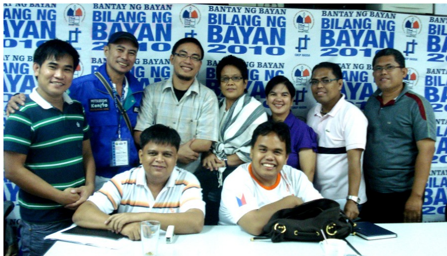
NAMFREL volunteers who serve as team leaders for the NAMFREL-Department of Health Medicine Monitoring Project, at the quarterly meeting held on July 2 at the NAMFREL headquarters in Mandaluyong City.