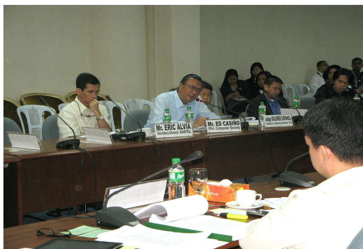
Sen. Aquilino Pimentel III, Chairman of the Senate Committee on Electoral Reform and People's Participation, discussing amendments to the Omnibus Election Code; Voter's Registration Act; Fair Elections Act and the Automated Election Systems Law with representatives of NAMFREL, Philippine Computer Society and Transparency International-Philippines in a committee hearing last December 6, 2011.