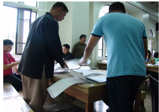
Recount committee sorting ballots before examining each vote.