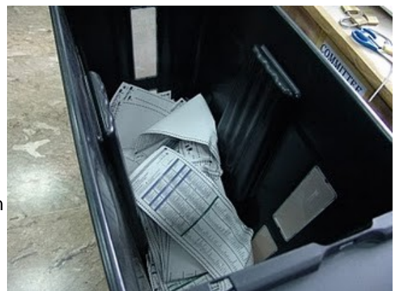
Ballots inside a just-opened box.

Contributing to their resistance against the PCOS, according to Macalintal, were the Comelec's charges of PhP700,000